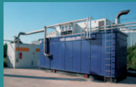
LANDFILL ÚHOLIČKY (CZECH REP.)