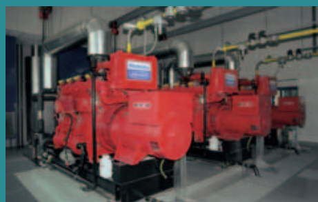
SLOVAK GAS INDUSTRY BRATISLAVA (SLOVAKIA)

flexible to place easier service and maintenance