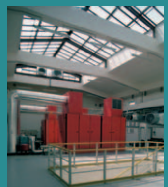
BRNO SEWAGE TREATMENT PLANT - POWER OUTPUT 2 X 520 KWE