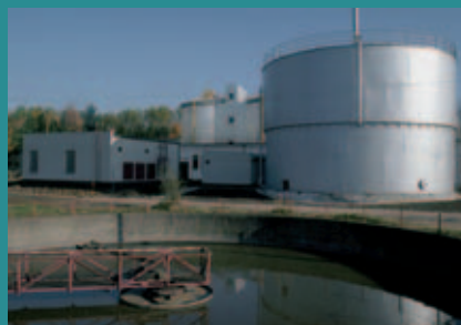
SEWAGE TREATMENT PLANTS