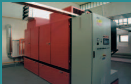
SEWAGE TREATMENT PLANT ĎESKÁ LÍPA (CZECH REP.)

easier to make project works easier mounting on site